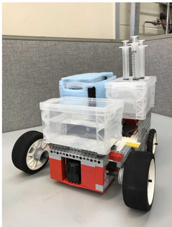
The Bully Buggy: Car Used in Spring 2018 Competition

The design process of the ChemE Car is complex. The car can be made from any material; however, incompatibility with 3D printed materials led the team to work with Legos. Because the car needs to be started chemically, the team divided the battery into a hot and cold side, and the voltage is produced from the temperature differential. The car is powered by an electric current flowing from the battery to the motor when it hits the photoresistors. The team uses three syringes to add starch and potassium iodate mixture to a sodium bisulfite mixture to produce a black